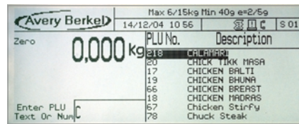
Informative dot matrix display. Example shows PLU search mode