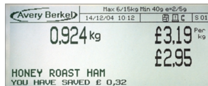
Promotional offers clearly displayed