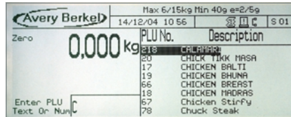
Informative dot matrix display. Example shows PLU search mode

The full dot matrix display ensures easy operation - and the perfect medium to communicate customer messages and promotions.