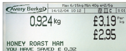
Promotional offers clearly displayed

The M601 has ample data storage capability for even the largest labelling operation - with option for expansion for up to 10,000 PLUs.